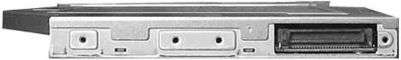
50 Pin Rear Connector